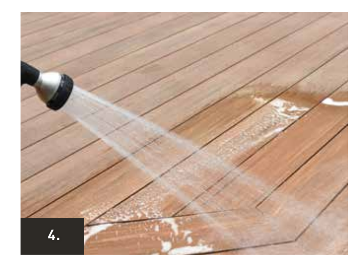
Rinse the treated area with clean water. For best results, dry or remove standing water with a towel or sponge mop. Then allow the deck to air dry completely. Note that any residual cleaner residue can leave a difficult to remove surface film. Always rinse thoroughly and never allow the cleaner to dry or evaporate on the surface prior to rinsing. For stubborn or missed areas, or areas where cleaner may have dried, repeat the cleaning process.