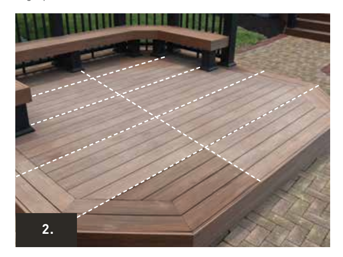
Working in one smaller area at a time, saturate with the diluted cleaner and allow it to stand on the surface for 30-60 seconds. DO NOT allow the cleaner to dry or evaporate before scrubbing. Avoid cleaning in direct sunlight as the heat generated may cause the surface to dry quickly as you attempt to clean. Rinse each section thoroughly after scrubbing and before soaking the next section.