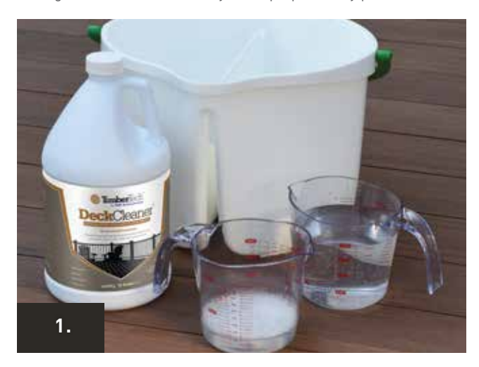
Shake well. Dilute TimberTech DeckCleaner mixing 1 part cleaner to 3 parts water. One gallon of diluted cleaner will cover approximately 1,000 square feet of surface area.

A power washer can be used for RINSING ONLY with TimberTech Deck or Porch. The recommended maximum pressure is 1,500 psi. A fan tip nozzle should be used. Spray in the direction of the grain pattern, never across the grain, to avoid damaging the product. Use caution not to damage the material and always take proper safety precautions when operating a power washer.