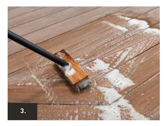
Using the recommended brush and extension handle, scrub using downward pressure; first scrubbing in the direction of the grain and then against the grain working the cleaner into the surface texture. DO NOT allow the treated area to dry before rinsing thoroughly as this will allow dirt residue to dry in the surface texture.